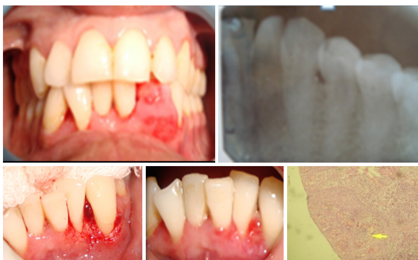
Figure 1: Pyogenic granuloma excision and histopathological picture.

A 63-year-old female from eastern part of Nepal presented with localized painless enlargement in upper arch proximal to gingival region of right canine and premolar measuring 1x1 cm in diameter. Bleeding on minor trauma and discomfort on eating and tooth brushing was experienced. Being a smoker, the patient worried of malignancy. Any systemic disease, medication, or allergy were not seen. Lymph nodes were not