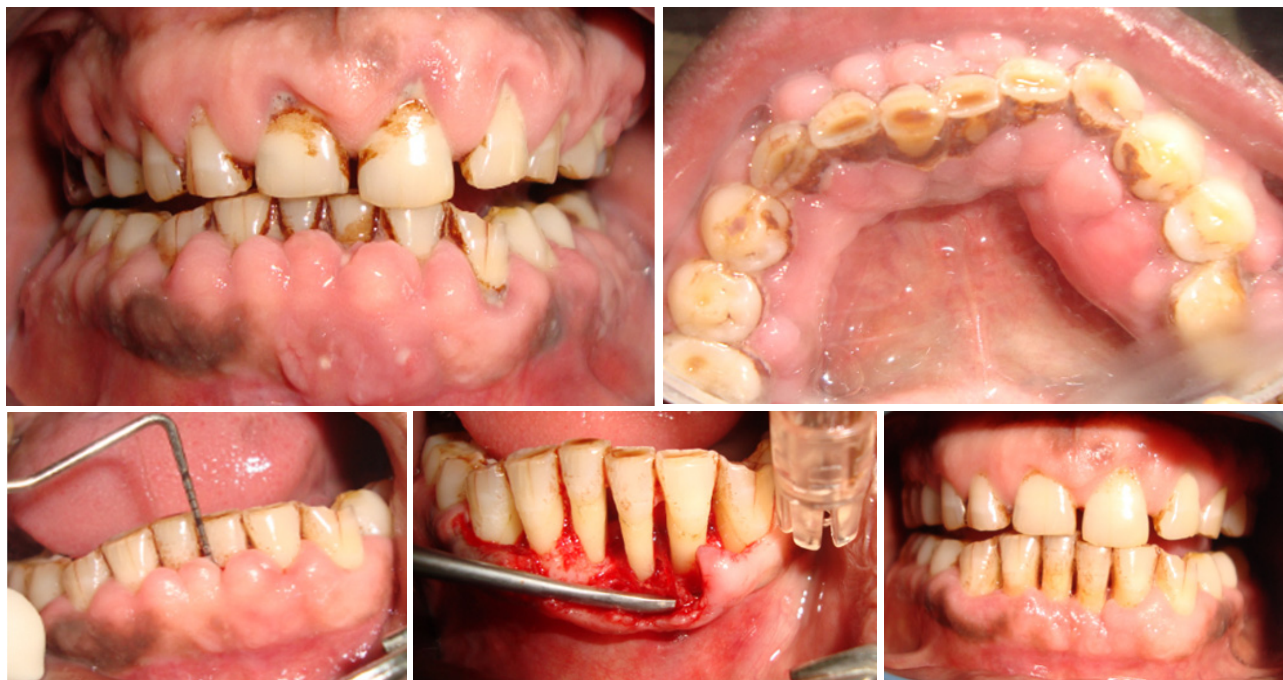
Figure 5: After nonsurgical and surgical therapy (Periodontal pocket depth (31) = 5-6mm).

and undisplaced flap technique for periodontal pocket reduction in lower anterior incisal region and external bevel gingivectomy where there was no bone loss as it was a combined type of enlargement.