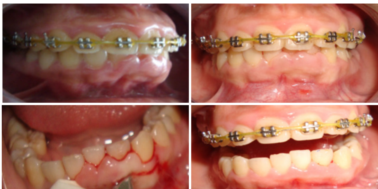
Figure 6: After surgical excision and healing.

overgrowth developed after decrowding of lower anterior segment which caused an aesthetic and functional problem. She had incompetent lip seal and habit of mouth breathing. External bevel gingivectomy was planned which was carried out with Kirkland knife after few visits of nonsurgical therapy.