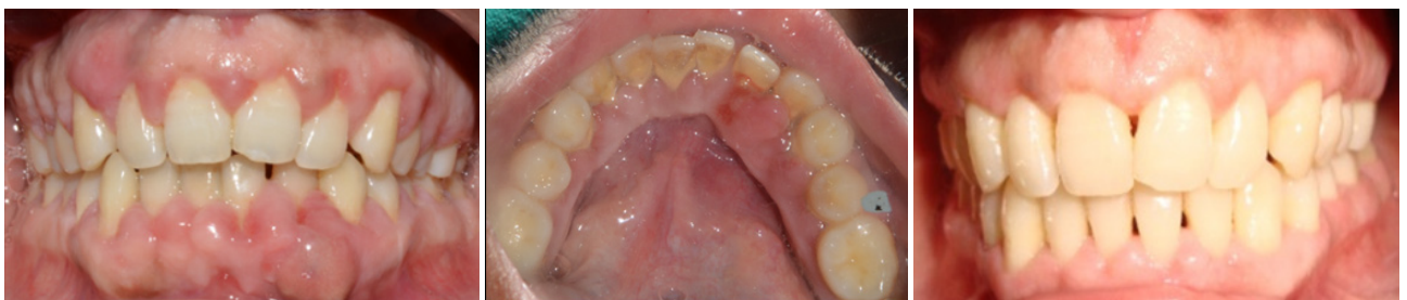
Figure 4: Before and after treatment.

A 48-year-old male reported to the department of dental surgery, perio unit, with chief complaint of enlarged gum in the mouth for last 5 years. He had pain on fractured left lower first molar and was unable to chew normally. He was hypertensive taking 5 mg of Amlodipine daily and Aspirin. He had a habit of smoking. After periodontal and radiographic assessment treatment started with drug substitution and nonsurgical therapy along with extraction of 36. As pain and inflammatory enlargement subsided, surgical therapy was planned, which included internal bevel scalloped incision